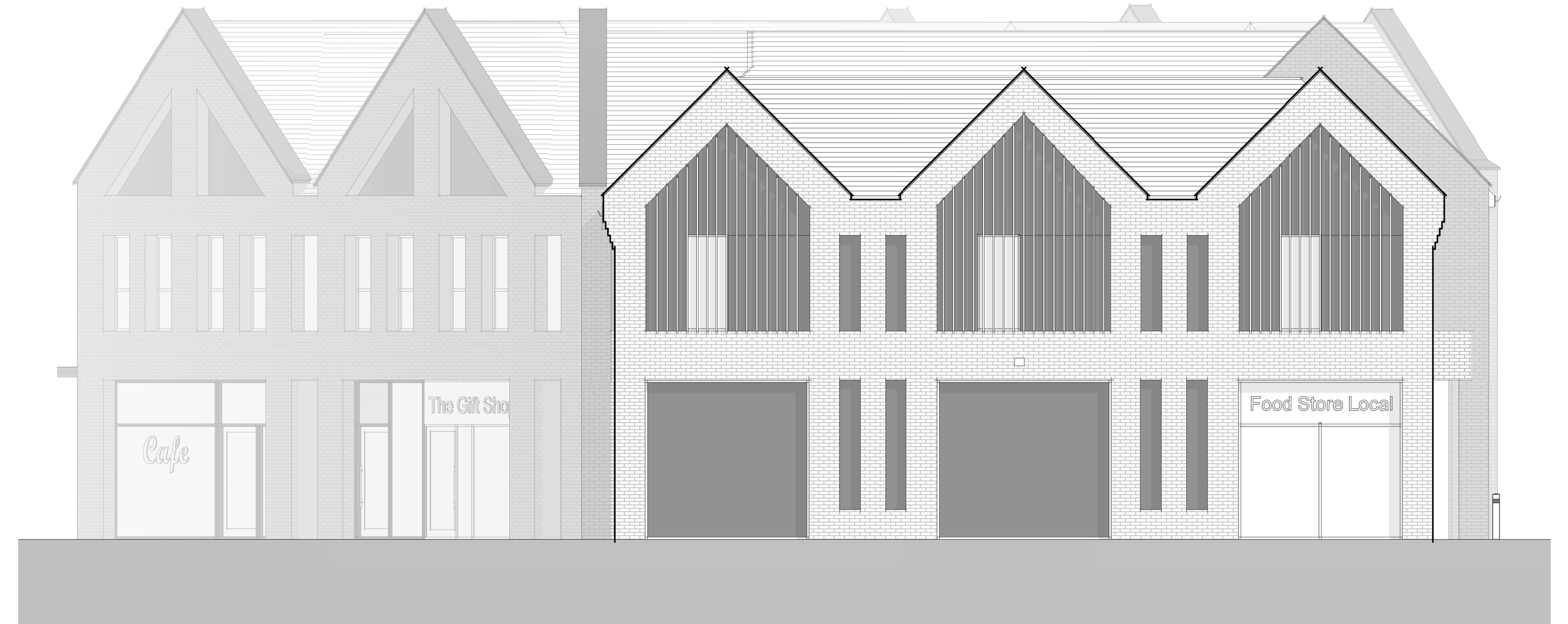
3 West Elevation 1 : 100