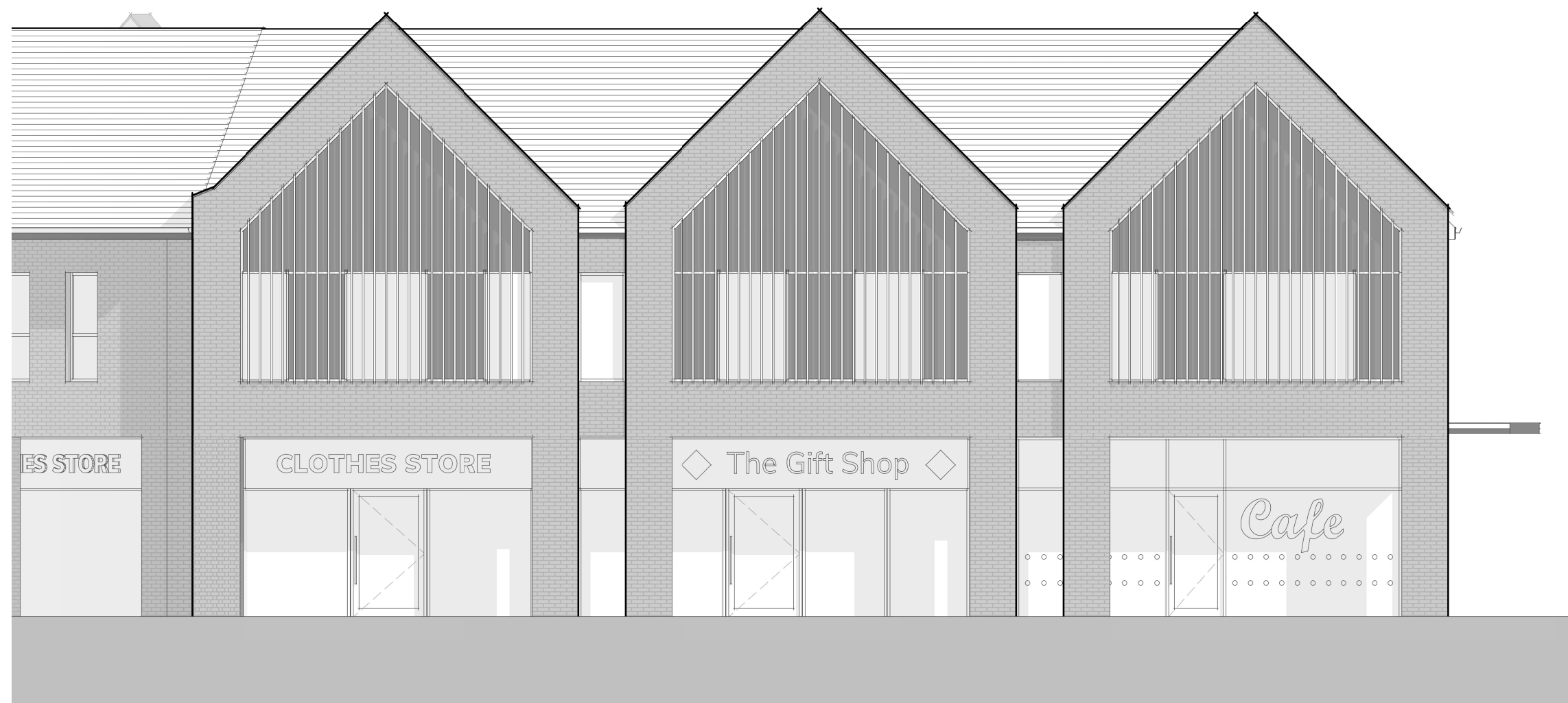
2 South Elevation B 1 : 100