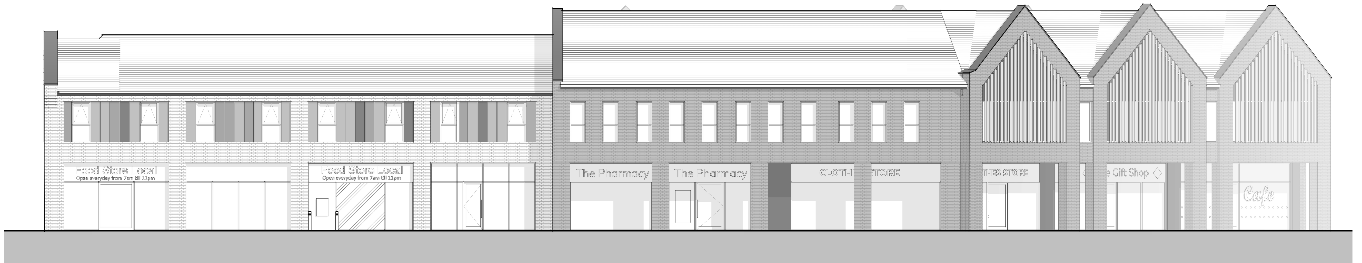
1 South Elevation A 1 : 100