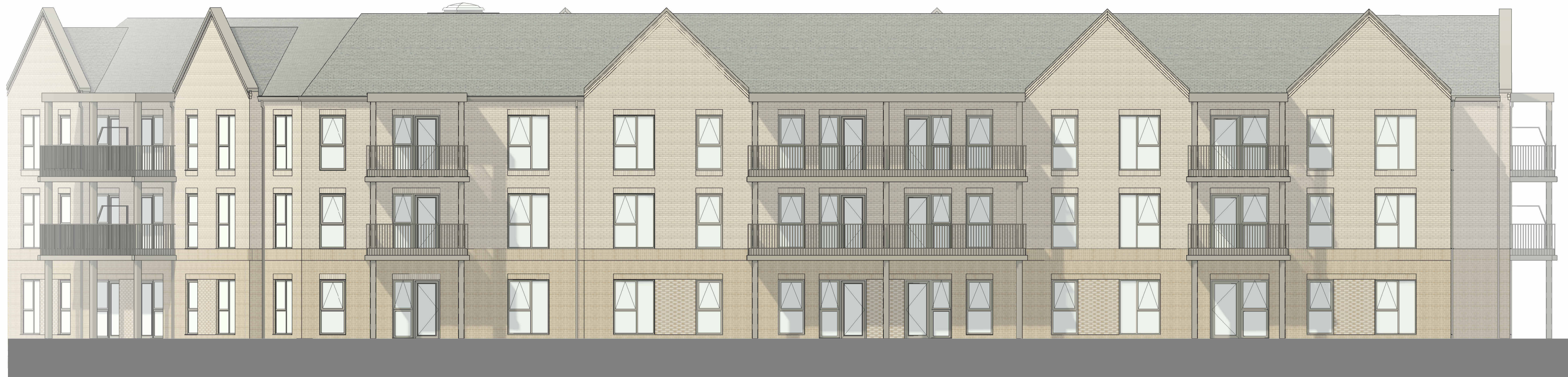
ELEVATION 01 1:100