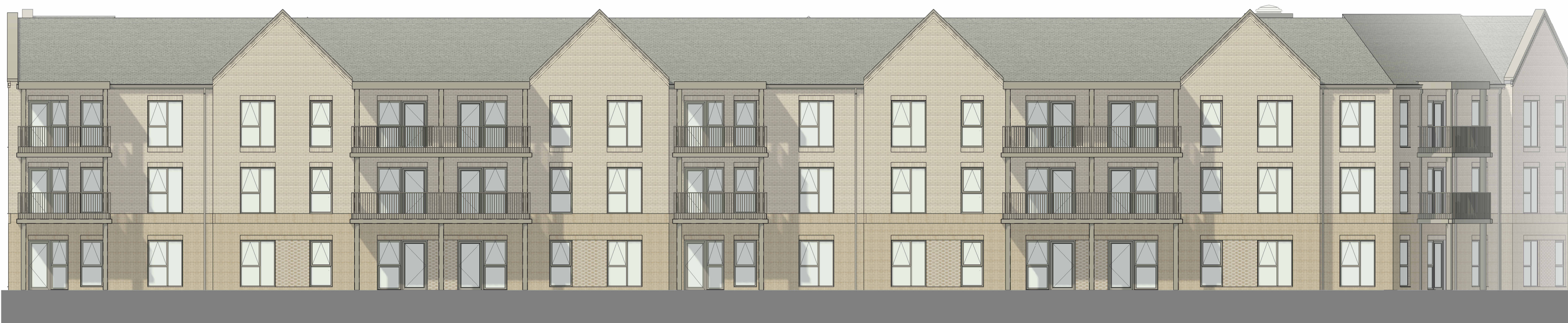
ELEVATION 02 1:100